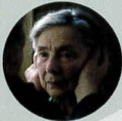
FRENCH 127 min 2012 MICHAEL HANEKE *CUSTOMIZED CONTENT