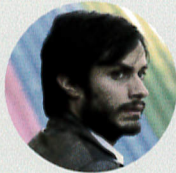
SPANISH 118 min 2012 PABLO LARRAÍN *CUSTOMIZED CONTENT