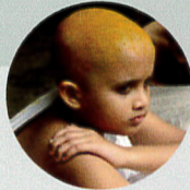
HINDI 117 min 2005 DEEPA MEHTA

Georges and Anne are an octogenarian couple. They are cultivated, retired music teachers. Their daughter, also a musician, lives in Britain with her family. One day, Anne has a stroke, and the couple's bond of love is severely tested. Academy Award winner for best foreign language film.