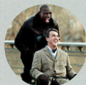
FRENCH 113 min 2011 OLIVIER NAKACHE & ÉRIC TOLEDANO *CUSTOMIZED CONTENT

A woman brings her family back to her childhood home, which used to be an orphanage for handicapped children. Before long, her adopted son starts to communicate with an invisible new friend. The Orphanage is an intense, Spanish horror film.