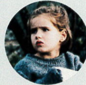
FRENCH 92 min 1996 JACQUES DOILLON

Based in the 1910s, the film follows political activists Alice Paul and Lucy Burns as they take the women's suffrage movement by storm, employing peaceful and effective strategies, tactics, and dialogues to help American women win the right to vote.