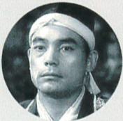
JAPANESE 82 min 1945 AKIRA KUROSAWA