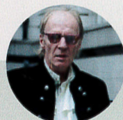
ENGLISH 78 min 2005 GREG WHITELEY

A mere 300 people inhabit Bakhta, Siberia. The locals, whose routines have hardly changed over the centuries, live according to their cultural traditions. Narrated by Herzog, the film follows the village through the Taiga's four seasons to tell the incredible story of a society untouched by modernity.