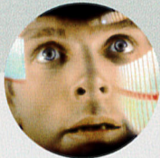
ENGLISH 148 min 1968 STANLEY KUBRICK

Ground control has been receiving bizarre transmissions from the residents left on the Solaris space station. When cosmonaut and psychologist Kris Kelvin is sent to investigate, he too experiences the strange phenomena afflicting the crew, sending him on a voyage into the dark recesses of his own mind.