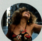
ITALIAN 95 min 2010 JOHN TURTURRO *CUSTOMIZED CONTENT

Set in 1944 as the war takes its toll on Allied Forces in Europe, a squadron of black pilots known as the Tuskegee Airmen are finally given the chance to prove themselves in the sky—even as they battle discrimination on the ground. Red Tails tributes unsung heroes that soared above their challenges.