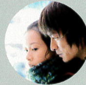
MANDARIN 100 min 2004 FENG XIAOGANG *CUSTOMIZED CONTENT

Jess is infatuated with football, but because she is female (and an orthodox Sikh), her parents will not allow her to play. However, when Jess' friend Jules, played by Keira Knightly, discovers Jess' skills, she invites Jess to try out for the local team, even despite Jess' parents' wishes.