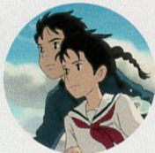
JAPANESE 91 min 2011 HAYAO MIYAZAKI