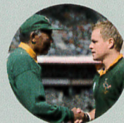
ENGLISH 134 min 2009 CLINT EASTWOOD *CUSTOMIZED CONTENT

At the age of 50, Mane's past as a great football player has been largely forgotten. But when training a youth team, Mane sees himself again in Kalu, a rebellious but talented youth. Mane is reminded of when he was also young, had opportunities, felt the sting of love and wasted his flame.