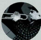
SPANISH 105 min 2000 FERNANDO TRUEBA

This documentary, narrated by Laurence Fishburne, challenges one of Americans' most cherished assumptions: that slavery in this country ended with the Emancipation Proclamation. The film tells how forced labor, tolerated by both the North and South, lasted well into the 20th century.