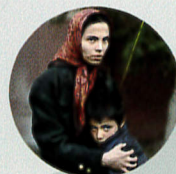
TURKISH 150 min 2011 NURI BILGE CEYLAN *CUSTOMIZED CONTENT

Based on the real life events of the former football phenomenon, the ever-controversial Diego Armando Maradona, this film follows the player from his childhood to his stages of greatest glory, in which he was awarded ten titles, including the best athlete of the century award in 2000.