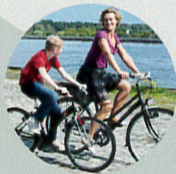
FRENCH 87 min 2011 JEAN-PIERRE & LUC DARDENNE *CUSTOMIZED CONTENT