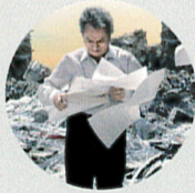
HEBREW 106 min 2011 JOSEPH CEDAR *CUSTOMIZED CONTENT