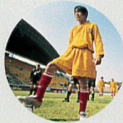
CANTONESE 89 min 2001 STEPHEN CHOW *CUSTOMIZED CONTENT

Set in 1970, ten-year-old Mirco find himself attending a school for the blind after an accident with hunting rifle renders him nearly sightless. There he secretly discovers the possibilities of the recorded sound.