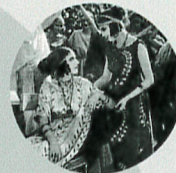
SILENT (ITALIAN) 88 min 1913 MARIO CASERINI & ELEUTERIO RODOLFI

Vision tells the story of multi-talented Hildegard von Bingen, the famed 12 th century Benedictine nun, Christian mystic, composer, philosopher, playwright, physician, poet, and scientist. Hildegard became the modern world's first female rebel, who defied patriarchy for the good of God and mankind.