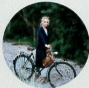
GERMAN 105 min 2012 CHRISTIAN PETZOLD *CUSTOMIZED CONTENT