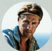
NORWEGIAN 96 min 2012 JOACHIM RØNNING & ESPEN SANDBERG

When Schultze, a retired miner who entertains polka audiences with his accordion, discovers the fiery energy of Zydeco music on the radio, the rigid monotony of his daily routine takes a spicy turn, leading him on a life-changing, liberating journey to the Louisiana delta.