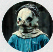
SPANISH 105 min 2007 J.A. BAYONA *CUSTOMIZED CONTENT

Join us for a special kick-off event on Friday, January 10 th . Hot cocoa, cookies, raffle prizes, IC buttons and more.