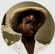
FRENCH 107 min 1983 EUZHAN PALCY

In the 1880s, a martial arts student named Sugata continues his quest to become a Judo master from the discipline's founder. Eventually, he learns enough to demonstrate his skill in a boxing match between American and Japanese fighters.