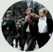
NORWEGIAN 113 min 2008 JOACHIM RØNNING & ESPEN SANDBERG *CUSTOMIZED CONTENT