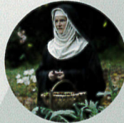
GERMAN 111 min 2009 MARGARETHE VON TROTTA

Against all odds, with scant resources, and under the scrutiny of dictator Augusto Pinochet's minions, a brash young advertising executive, René Saavedra, and his team devise an audacious plan to win the 1968 Chilean election and set Chile free.