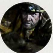
ENGLISH 83 min 2012 JANET TOBIAS