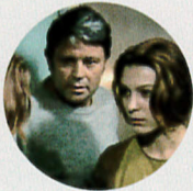
RUSSIAN 169 min 1972 ANDREI TARKOVSKY