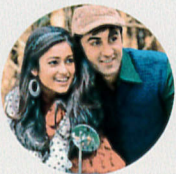
HINDI 151 min 2012 ANURAG BASU