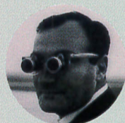
FRENCH 28 min 1962 CHRIS MARKER

A dazzling Academy Award-winner, Kubrick's drama of man vs. machine and stunning meld of music and motion visits the prehistoric ape-ancestry past, then leaps millennia into colonized space, and ultimately whisks astronaut Bowman into uncharted realms of space, perhaps even into immortality.