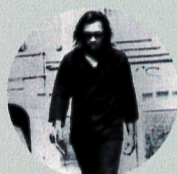
ENGLISH 86 min 2012 MALIK BENDJELLOUL *CUSTOMIZED CONTENT

Jose, a bright, mischievous 11-year-old orphan, lives with his grandmother, a tough, wise woman determined to save Jose from the hard life of the plantation. When Jose wins a partial scholarship at a school in the city, she is ready to sacrifice everything for his chance at an education.