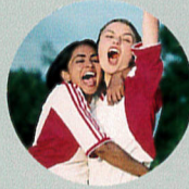
ENGLISH/ PUNJABI/ HINDI/GERMAN 112 min 2002 GURINDER CHADHA

Eliezer Shkolnik and his son Uriel share a great rivalry as eccentric professors in Talmudic Studies. When both men learn that Eliezer will be lauded the Israel Prize for his work, their complicated relationship reaches a new peak.