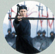
MANDARIN 99 min 2002 YIMOU ZHANG

Water tells the profoundly moving story of Chuyia, an Indian girl married and widowed at eight years old, who is sent away to a home where Hindu widows must live in penitence. Chuyia's feisty presence deeply affects the other residents, forcing each to confront their faith and society's prejudices.