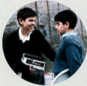
ITALIAN 96 min 2005 CRISTIANO BORTONE *CUSTOMIZED CONTENT