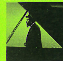
Straight, No Chaser