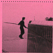
Man on Wire