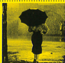
Nights of Cabiria

Krzysztof Kieslowski's dark comedy—the middle segment in his "three colors" trilogy—shows Polish immigrant Karol Karol as he's humiliated in a public courtroom by his wife during their divorce proceedings. Shamed and brokenhearted, he finds an ally in a fellow countryman, and the two eventually concoct a way back to post-Communist Poland, where Karol sets about rebuilding his life. 1994 | directed by Krzysztof Kieslowski | Polish | 91 minutes | color | content filtered