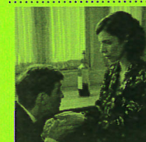
The Blind Sunflowers