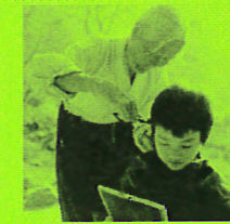
The Way Home