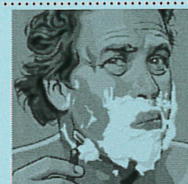
The Five Obstructions